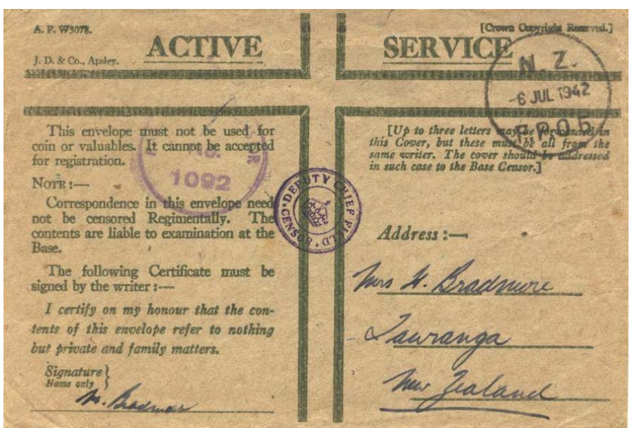
FPO 5 dated 6 Jul 1942 with censor 1092 also Deputy Chief Censor (applied Cairo) .