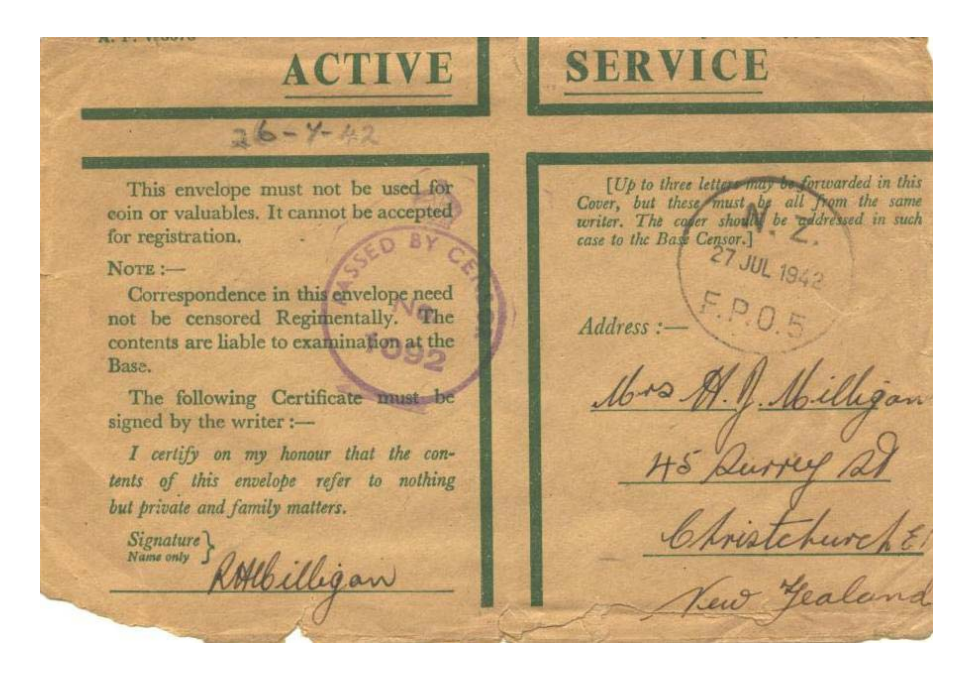
Example dated 27 Jul 1942 sent at the surface free.

No 1 Convalescent Depot had 2 NZ General Hospital in an adjoining area of Kafar Vitkin during June/July 1942 after the hospital left Nazareth. On the 26 July 1942 the Hospital transferred to El Ballah, Kantara West where it remained for 18 months. NZ FPO 4 served this hospital. Has anyone seen any covers from FPO 4 dated June or July 1942? (McKinney 1952:225-226). Soldiers were sent to No 1 Convalescent Depot from the hospitals and as such it is logical that covers from here could come from various units.