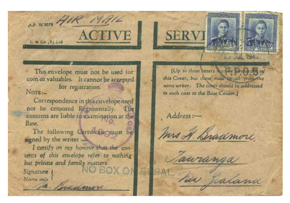
Example dated 27 Jul 1942 sent at the airmail rate of 6d.