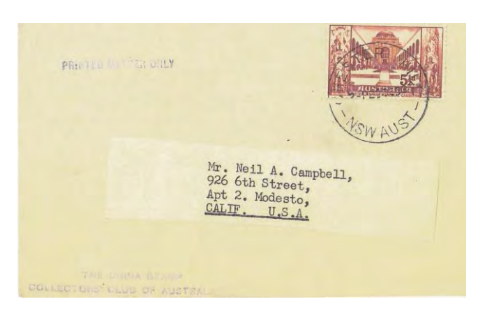
1958 Correct franking for 2 to 4 ounce printed matter to USA

Just under 6 million of the stamps were issued. At this distance in time it is hard to guess how many stamps were used as intended. If the number of surviving examples of postal history is any guide, there seem to be not many. Indeed, surviving commercial usages are mostly of a make-up kind, that is, with other values for airmail letters, etc. At last though, an apparent correctly solo franked item has turned up, mailed as printed matter by the China Stamp Collectors Club of Australia to U.S.A. in 1958.