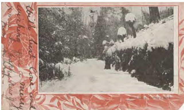
Snow scene Tommy's Bend

The scene is of Tommy's Bend. This is a stretch of road 10 kilometres from Marysville on the Woods Point Rd up to Lake Mountain. Today it is a favourite climb of cyclists testing their physical skills. The climb from Marysville is 21.3km long and rises at an average gradient of 4.3%. The first 4.3km of the climb are the most challenging with an average gradient of 8.1%.