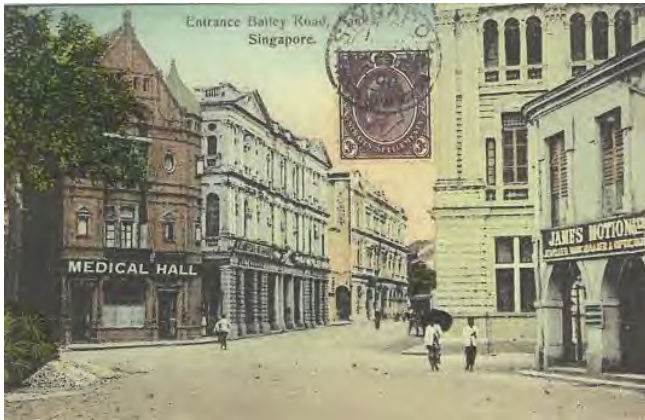
Illus. 1. Front

From time to time we see old postcards that in a sense are 'philatelic' in that they have been sent with the object of being put in a collection. The clearest evidence of this is the one shown below sent from Singapore to Australia in 1908. The printed message on the card solicits the exchange of postcards, and also has a hand-written message asking that the stamp be stuck on the view side.